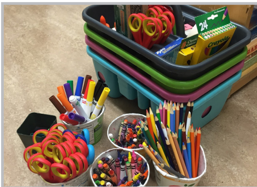
Use recycled containers to separate materials.