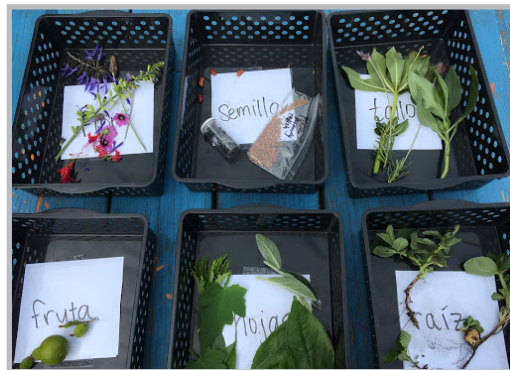
Trays are useful for materials set-up.