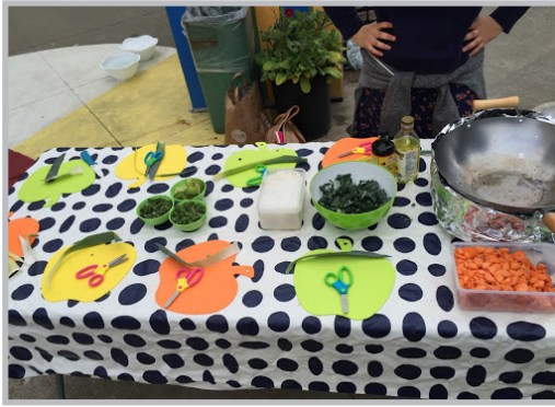
Set up work stations ahead of time.