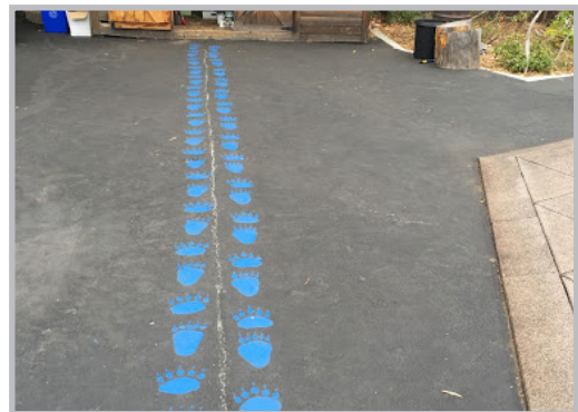
Mark areas where students should line up.