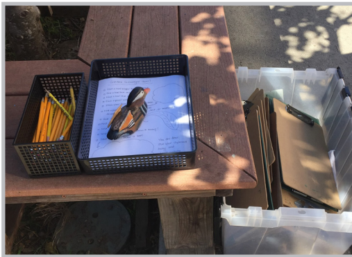
Worksheets, pencils, and clipboards are neatly laid out in designated containers.