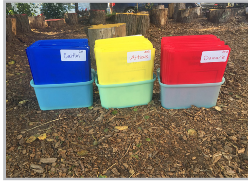
Use colors to easily distinguish between grades and classes. In this example, each grade has a different color bin and each class within a grade has a different color folder.