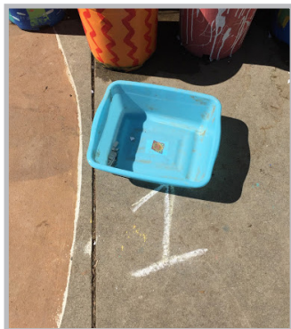
Designate group work stations with labels.