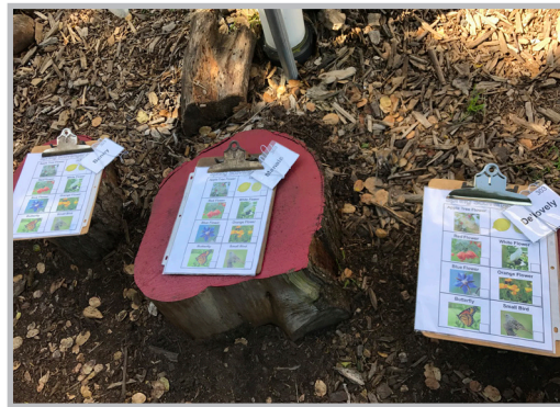
It's helpful to put worksheets on clipboards ahead of class for younger students.